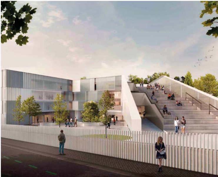
*The new School of Humanities and Communication Sciences is currently under construction.